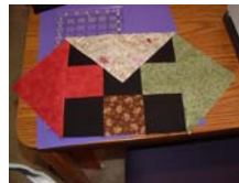
match fabrics and center