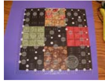
square to 9"