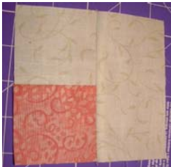
Make 4 units

Sew four 2 1/2" squares background and pink – B and D together. Press to the pink. Sew a background piece A (2 1/2" x 4 1/2") onto the right side of the previous unit placing the pink on the bottom left of the rectangle. Press to the rectangle. Make four corner units @ 4 1/2" square.