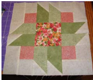
12 1/2" unfinished

Following photo of finished block, lay out your 4 1/2" square units. Sew each row together, pressing in opposite directions. Sew the rows together and press to the center. Block will measure 12 1/2" (12" finished) square.