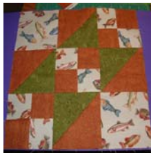
12 1/2" unfinished (12" finished)

Remember to make an additional block from your stash! We look forward to seeing your completed quilt top or quilt for the Comfort Quilts later in the year.