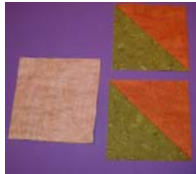
HST – make 4