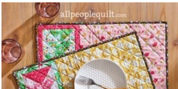
Summertime Place Mats

Check out this website for a cute placemat pattern: